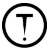
D2B - Toxic